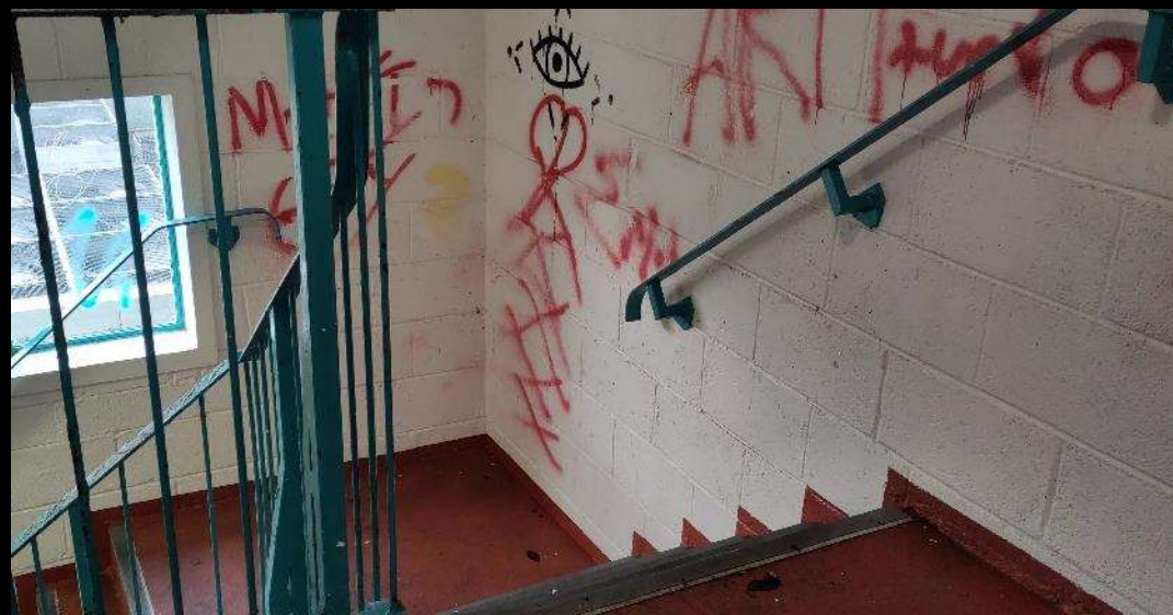
Back staircase / emergency exit (to yard)