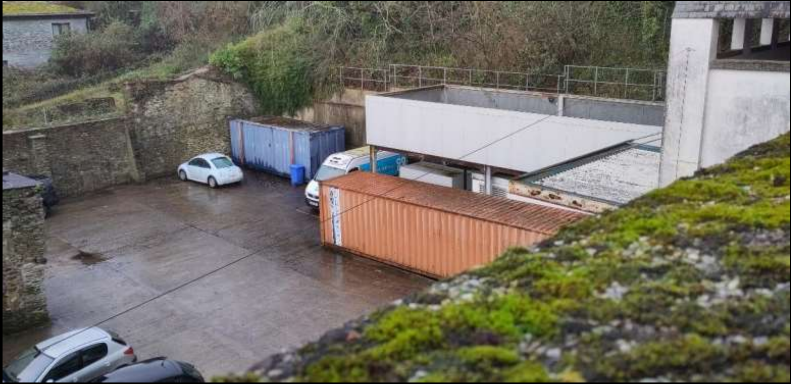
Side yard seen from top floor and from Brook Street. (Used for supermarket staff / deliveries, not public parking.)