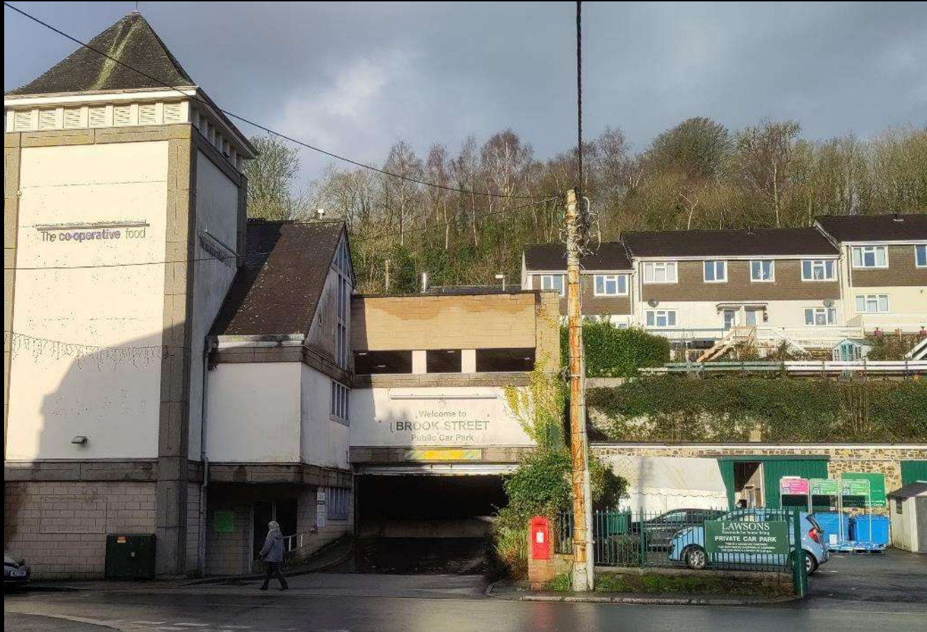
Vehicle entrance as seen approaching after turning off A386 from east.

Houses are on Old Exeter Road (seen from rear). Open car park is private to another shop.