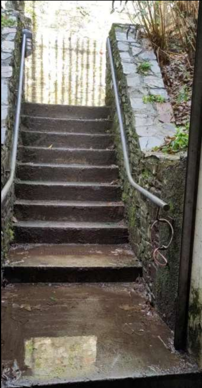
Steps from rear of car park (middle floor) to Old Exeter Road