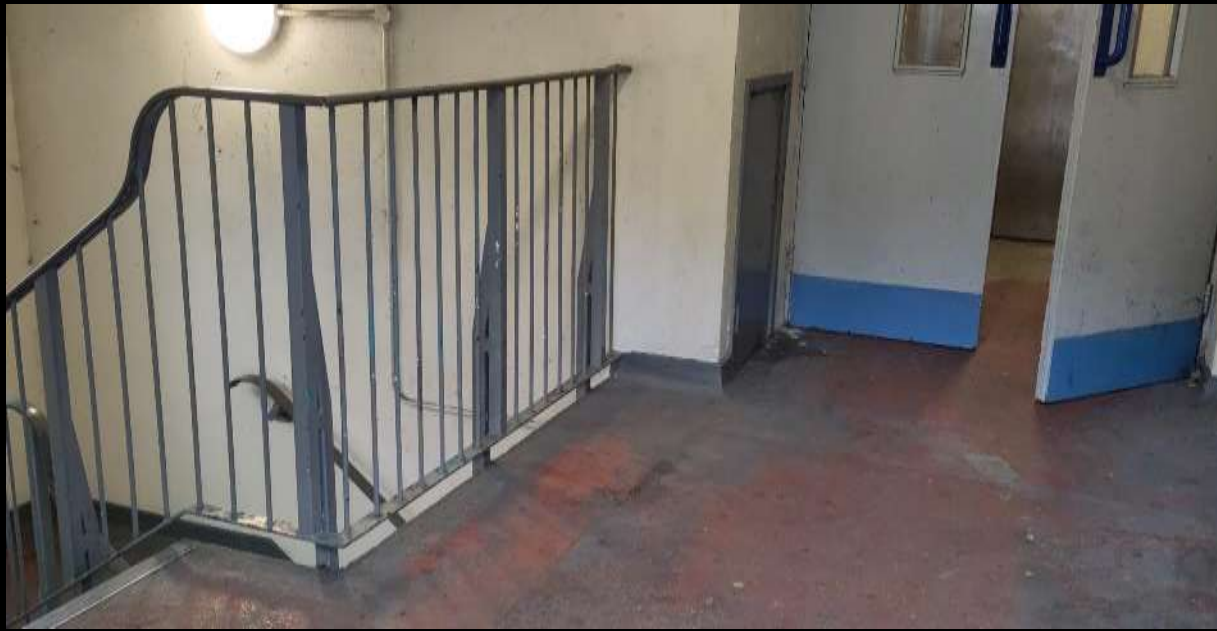
Top landing showing stairs and doors to lift lobby.