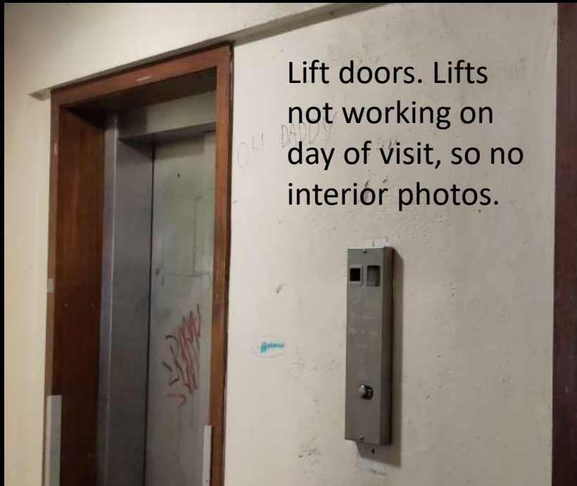
Lift doors. Lifts not working on day of visit, so no interior photos.